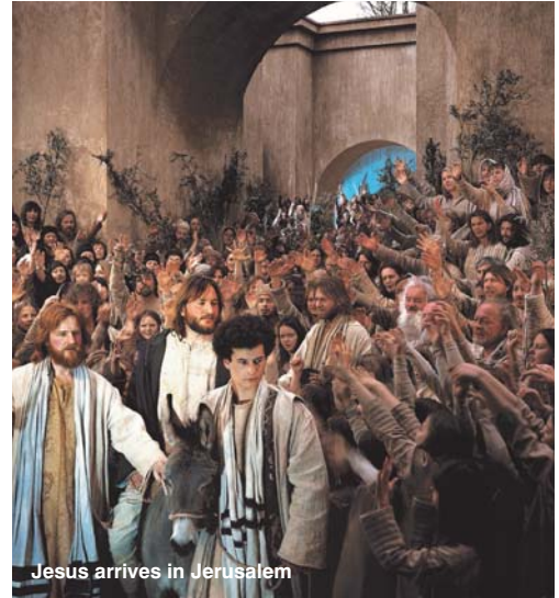
Jesus arrives in Jerusalem

This morning we visit Neuschwanstein Castle, the 'castle of the fairy tale king'. The shy King Ludwig II had built the castle in order to withdraw from public life but seven weeks after his death in 1886 Neuschwanstein was opened to the public and today it is one of the most popular of all Europe's castles. We travel on to Linderhof Palace. Built between 1874 and 1878 and the smallest of King Ludwig II's three royal castles, Linderhof was originally intended as a hunting lodge but later he declared it would be a new Versailles and the wonderful French Rococo interiors and beautiful parkland certainly reflect that ambition.